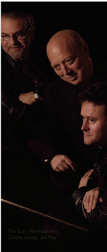
Trio Sud - Mermaid Arts Centre, Sunday 3rd May